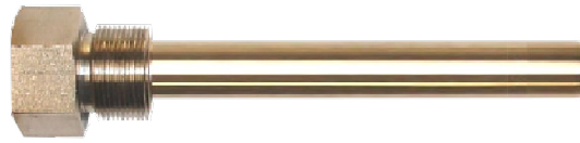
S.PO1: Stainless Steel Straight Pocket